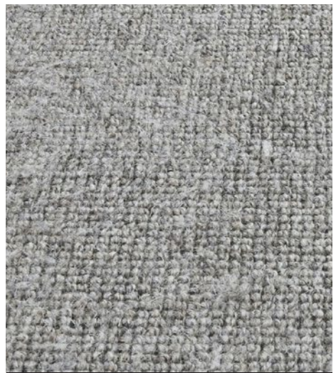
Shedding is not a manufacturing defect but rather a characteristic of a new quality carpet. This will diminish over time with routine vacuuming.

Carpets, like all other dyed textiles, will slowly lose colour over time when exposed to direct sunlight and should be protected from prolonged periods of direct sunlight. Colour change can also occur as the results of ozone, emissions from heating fuels and air conditioners, pesticides, cleaning agents, benzoyl peroxide and other household items. The occurrence, known as ozone damage, is largely unexplained, but appears to be more prevalent in coastal areas with a high ultra-violet content.