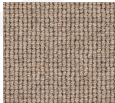
Forty Seven 5047