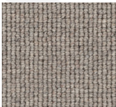
Twenty Eight 5028