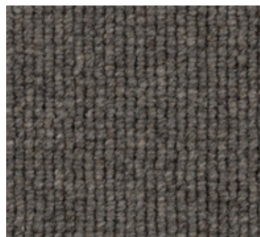
Eighty Eight 5088