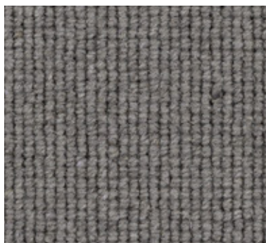
Sixty Three 5063